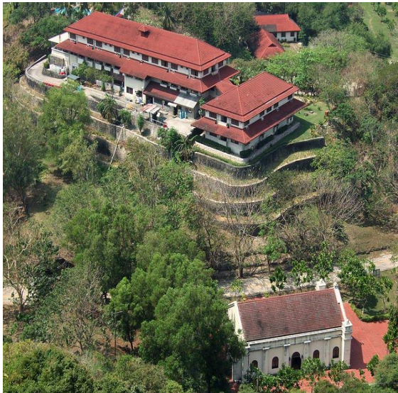
Corregidor Inn, Cavite City