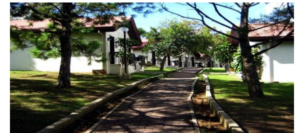
Angel's Hills, Tagaytay City

Location: Maitim II East, Tagaytay, City Tel.: 413-2501/2502