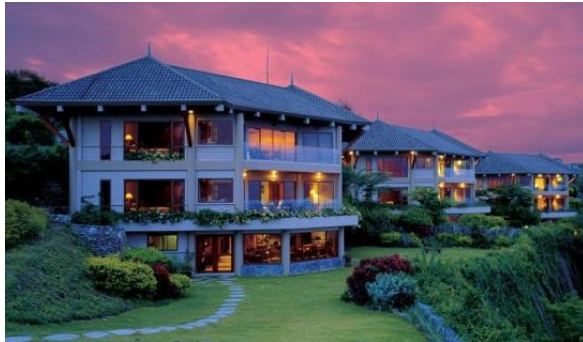
Balai Taal, Tagaytay City