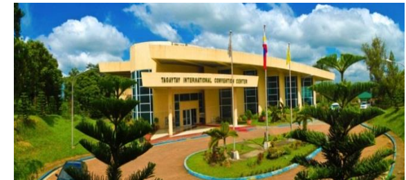
Tagaytay International Convention Center, Tagaytay City

Tagaytay City 4120, Philippines CP - 0920-494-6905 Phone: 0063-046-413-1380 Fax: 0063-046-413-0088 Email: chstagaytay@yahoo.com Web: canossaphil.or