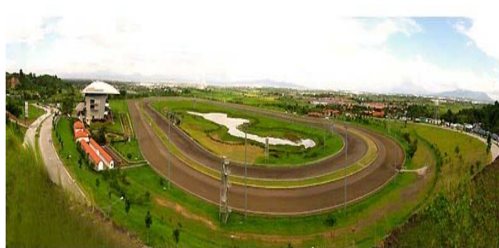
The San Lazaro Leisure Park, Carmona Cavite