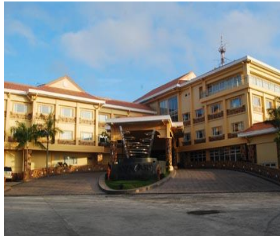
Tanza Oasis Resort & Hotel, Tanza, Cavite