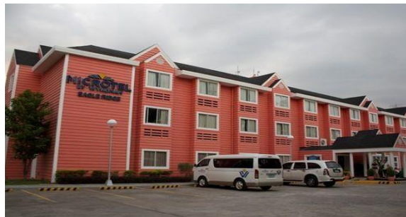
Microtel Inn by Wyndham, Eagle Ridge, Gen. Trias, Cavite