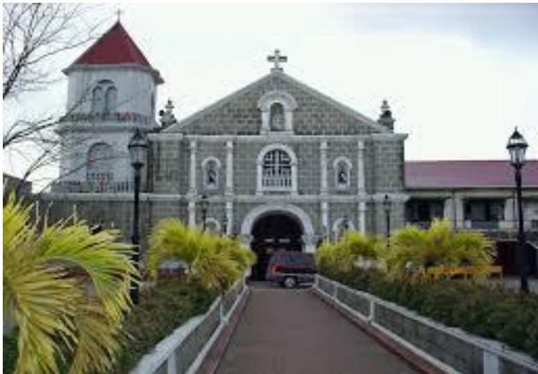
St. Gregory the Great Church, Indang