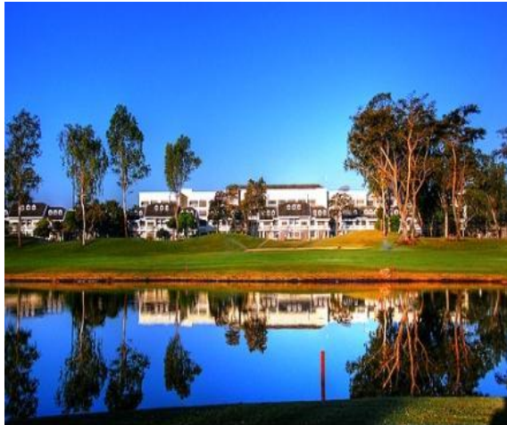
Manila Southwoods Manor, Carmona, Cavite