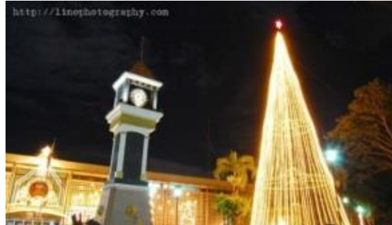
Cavite City Millenium Capsule Marker

Significant events, great personalities, trivia, etc. happened, transpired and emerged in Cavite City which influenced in small or great measure the history and transformation of not only Cavite City but the whole country as well.