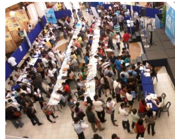
Applicants swarm in, as the organizers assisted them during the labor day job fair, alongside many partner companies such as Coca-cola Bottlers and SM Hypermarket to mention a few.

PPESO also participated in Job fairs wherein they joined the program events. They also validated job fair concerns such as determining the number of attendees, employers and job vacancies and ensuring over-all fair conduct during the affair. A report regarding the job fair conducted is being produced and new job vacancies garnered during the event were then posted to the LMI boards.