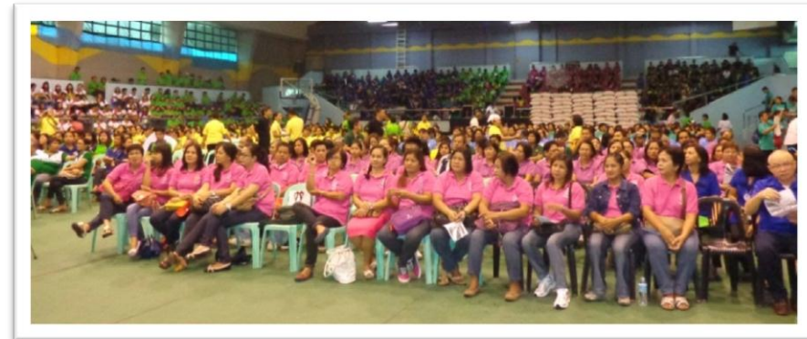
Theme: Cooperative Paves the Way for Inclusive Growth

The event served as a kick-off activity of the annual province-wide cooperative month celebration every October. It featured a six-component line of activities—the Parade of Municipal/City Development Councils with their respective cooperative delegations; the Opening Salvo which was graced by the high ranking officials of the Cooperative Development Authority and the Provincial/City/Municipal Local Government Units of Cavite; the CO-OLYMPICS which became a showcase of various talents and sportsmanship skills of cooperative members in Cavite; whole day Trade Fair and Exhibits participated in by Cavite Coop-preneurs; Blood-Letting Activity for volunteer blood-donors; and the Awarding Ceremonies for the winners of the Annual Search on Outstanding Cooperatives in the Province of Cavite and giving of Certificates of Recognition and Citations for those cooperatives with special accomplishments and contribution to cooperative development.