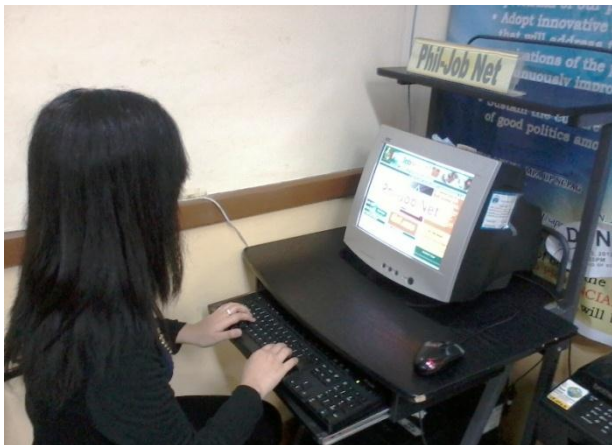
An applicant creates an account at Phil-Job.Net. She, along with other applicants was given a password slip (right) to serve as reminder of their account details

introduction to PESO. The applicant would also be given a PEGC kit which contains tips for aspiring job seekers. PPESO also assists applicants in enhancing their resumes.