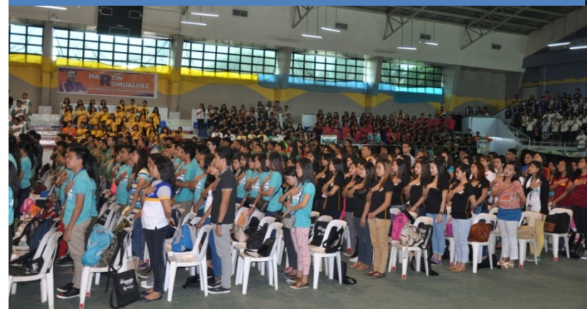
Student participants from various colleges and universities in Cavite.

According to GIZ, a company that specializes in international development, despite the Philippines' significant economic growth, the country still faces a greater challenge – that is to achieve sustainable economic and environmental development which will benefit different groups of the community including those who are socially disadvantaged.