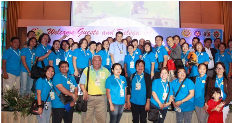
Participants at the 14 th Coop Congress with keynote speaker Congressman Sherwin Gatchalian.