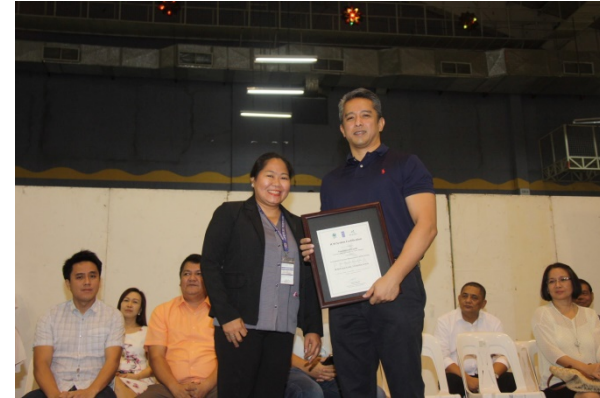
Figure 2. Turn-over of the ICM Level 1 Certification to Governor Juanito Victor C. Remulla Jr.

sustainable financing mechanism both from the provincial and local government levels and most especially the involvement of the community and key sectors.