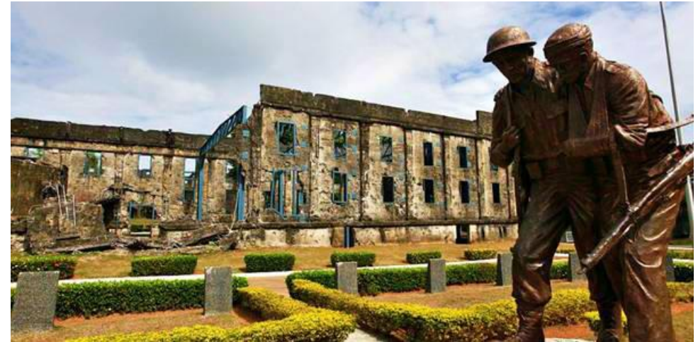
Brothers-in-Arms monument and Cine Corregidor ruins.

During the Spanish time, there is presence of missionary orders, specifically the friars, who played significant roles in the Spanish occupation of the country. These missionary orders acquired vast haciendas in Cavite during the 18th and 19th century. These haciendas became the source of bitter agrarian conflicts between the friar orders and Filipino